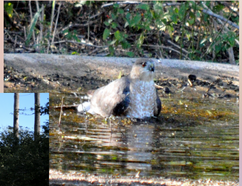
bathing Cooper's ^ Hawk |