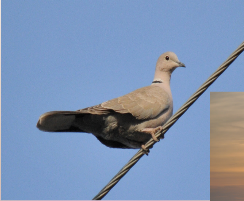
← Eurasian-Collared Dove